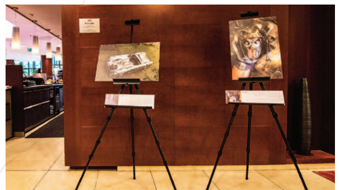
Welded Art Photographic Exhibition