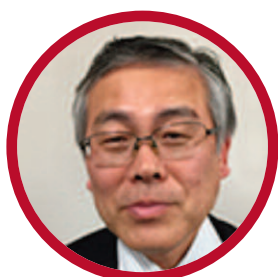
C-XII / ARC WELDING PROCESSES AND PRODUCTION SYSTEMS Prof. Satoru Asai