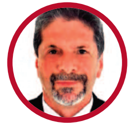
PROF. AMÉRICO SCOTTI (Brazil)

In 2019, Volume 63 of Welding in the World published six issues containing 160 papers and over 1900 pages of fundamental and applied research associated with materials joining and allied technologies. The topic distribution of papers published in 2019, arranged by Technology Area, is shown in the figure on page 16.